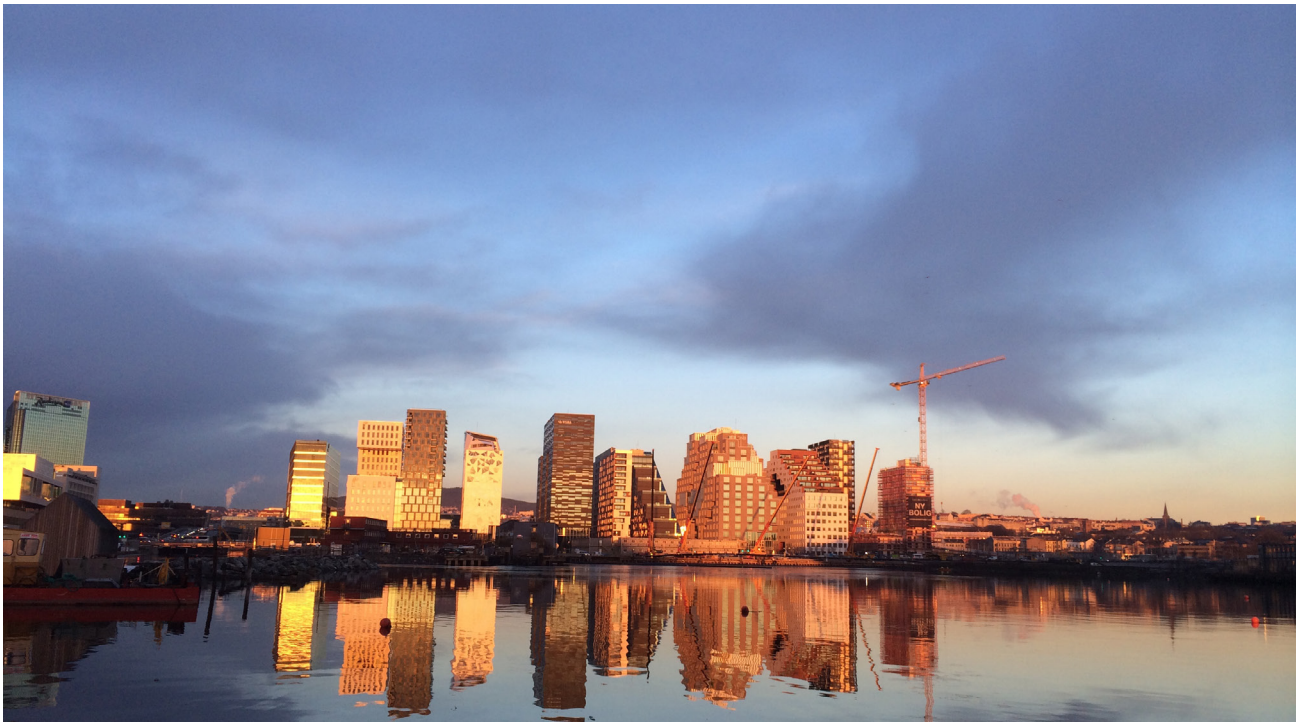
DNB Bjørnvika, OSLO

DNB, one of the largest Financial Services groups in the Nordic region, saved 25% on their MIPS cost with the help of SMT Data's ITBI solution.